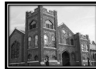
Viroqua UMC 221 S. Center Ave. Viroqua, WI 54665

God, the giver of life, generous giver of gifts and abilities, help us discover our talents and have the courage to use them to serve you and our community with unimagined new purposes on behalf of Jesus Christ. Amen.