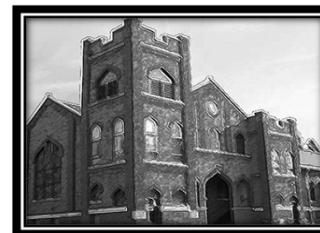
Viroqua UMC 221 S. Center Ave. Viroqua, WI 54665

God, the giver of life, generous giver of gifts and abilities, help us discover our talents and have the courage to use them to serve you and our community with unimagined new purposes on behalf of Jesus Christ. Amen.