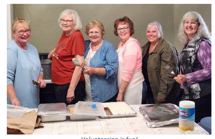
Volunteering is fun! Image of some of the volunteers from the Liberty Pole Chicken & Noodle/Chili Meal in October 2023.

Liberty Pole Methodist Church's 150<sup>th</sup> Anniversary Celebration will be held on Sunday June 30<sup>th</sup>, 2024.