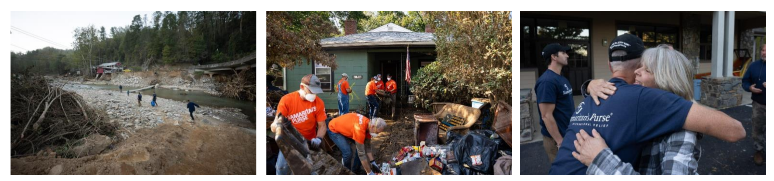
Liberty Pole, New Hope & Retreat Methodist Churches – Visit us online at: www.driftlessministry.org

Driftless Ministries c/o Hurricane Relief E2286 State Highway 82 De Soto, WI 54624