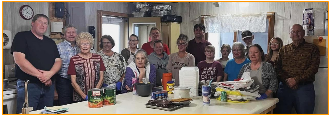
Some of our 2025 Bazaar volunteers. Thank you to all who helped to make the event a success!

The Retreat Methodist Church thanks everyone who came out to support the church during our Fall Turkey Bazaar. It was wonderful to see everyone gathering around the table again to share a delicious meal with family, friends, and neighbors. We greatly appreciate your continued support of our ministry here in the community. A huge thank you also goes out to all our amazing, hard-working volunteers! This event is a big undertaking, and it would not have been possible without you! Thank you so much!